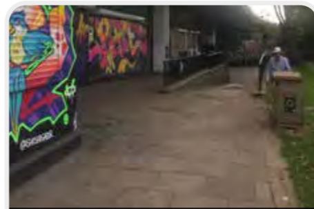
Buildings should activate the green and the public realm where possible