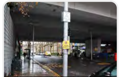
Create welcoming and vibrant arrival point