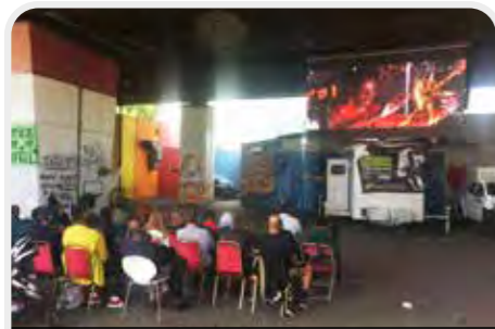
A new public square used by the community for a variety of activities