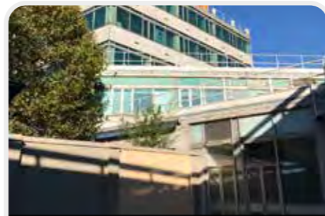
Opportunity to integrate neighbouring buildings into the public realm