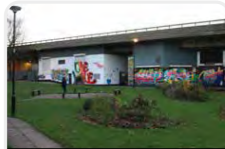
Introduce more biodiversity and enhance Maxilla Green