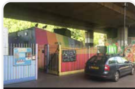
Opportunity to provide new buildings for community use